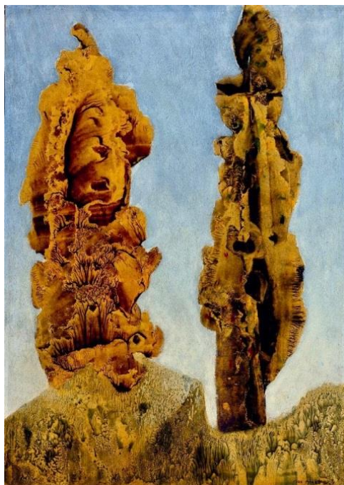
Max Ernst Les Peupliers 1939