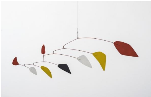
Alexander Calder Untitled 1966

Galerie Thomas is proud to announce in addition: masterpieces by German expressionist Emil Nolde, American artist of Classic Modernism Alexander Calder, German Bauhaus teacher Oskar Schlemmer and others.